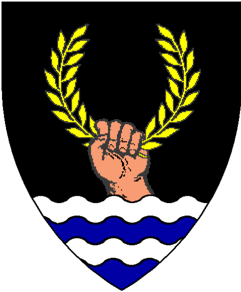
The device of St. Swithin's Bog