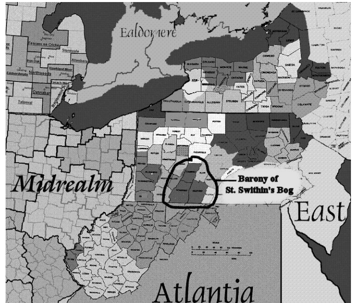
Cambria, Somerset, Bedford and Westmoreland Co, PA.

Sable, a sinister hand proper sustaining a laurel wreath Or and emerging from a ford proper